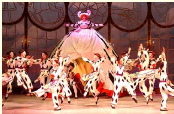
Photo: Dayton Ballet's performance of the Nutcracker

The Dayton Ballet School finished the first half of the school year by having many students performing in the Nutcracker . We are very proud of these students. Sixty-five young people participated in the double cast performances. Many of them are Dayton Ballet Sr. and Jr. members. It is always a rewarding experience for the children to be able to perform with the professional company.