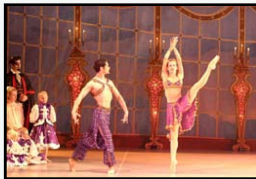
Photo: Dayton Ballet's performance of the Nutcracker